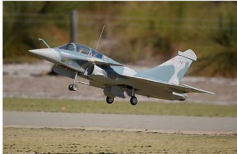
Rowdy's Rafale just about to touch down