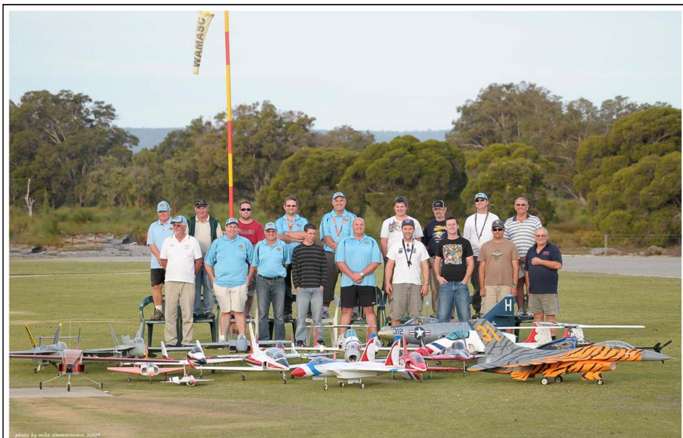
Pilots of Jet Rally 2009 - Whiteman Park