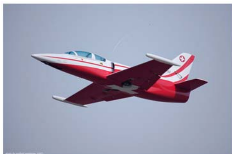
Rowdy's Albatross on a fly-by

The whole atmosphere was very relaxed and very much in keeping with many of the Jet events held around the country these days. There was no entry fee required only a simple registration and frequency listing for each pilot. The full display approvals were obtained from CASA even though the event was not advertised as a public display and no entry fee was required at the entry gates. As we all know the word spreads very quickly through the modeling community with it's many friends and the crowd became very substantial, particularly over the Saturday and Sunday. Warwick Mitchell being the named on the approval documentation to CASA performed a great job in co-coordinating the airspace height requirements and model flying activity over the weekend