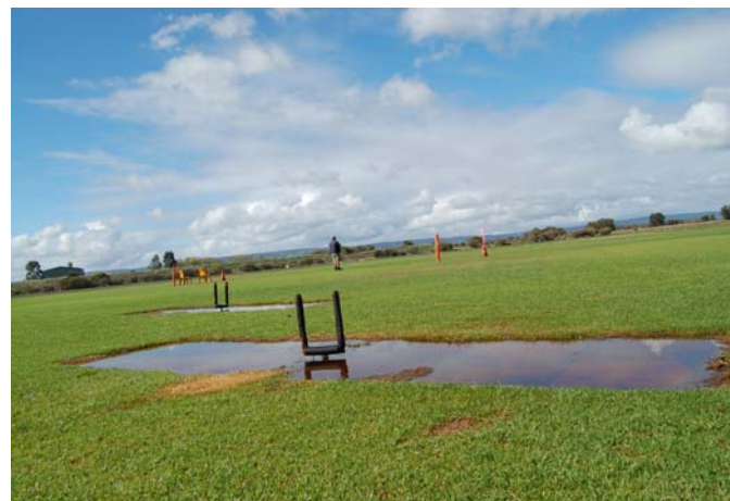
Just another winter's day down at the field. Yes, that's water over the slabs, some 30mm of water in fact! Ed.

Note for F4C Scale only: Static judging starts 09:00. Flying from 1pm until all contestants have completed required flying tasks.