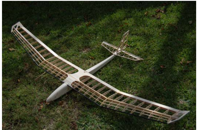
The editor's House of Balsa 2 x 6 waiting for covering.

(Ed) If you have any photos or stories you wish to share with the KAMS community, send them through to curare@iinet.net.au , and I'll do my best to see them published.