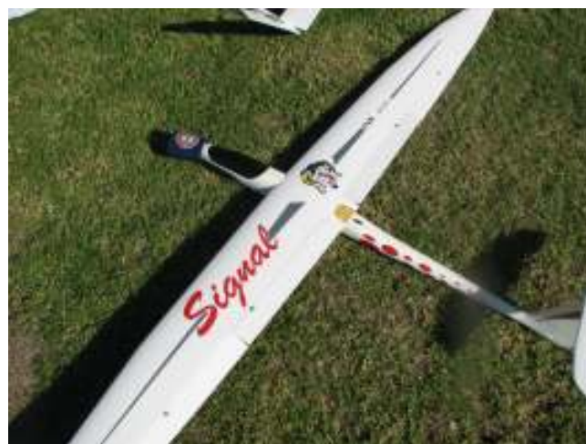
Chris Martin's "Signal"

Note 1: Static judging starts 09:00. Flying from 1pm until all contestants have completed required flying tasks.