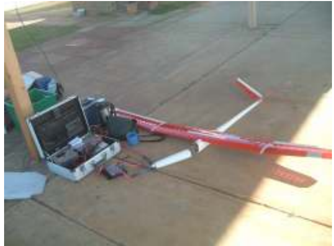
Margaret's "Silent Dream" charging

Only minor problems cropped up during the contest. All the computer gurus were not available to score so we resorted to ye olde fashioned paper and pencil, which worked out very well as competitors could watch over my shoulder as I wrote in the flying time, motor runs and landing points and then before the calculator could be picked up had worked out the scores for me.