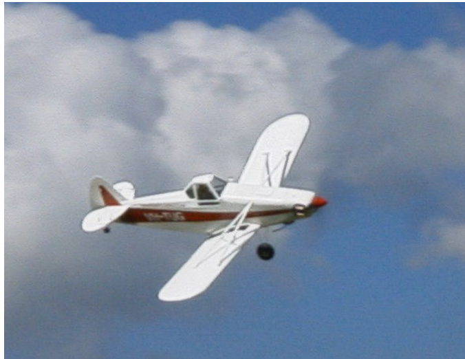
SPIES TELL ME THAT VH-TUG FLIES AGAIN!