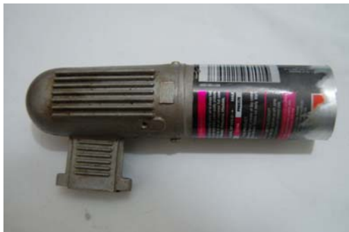
Food for thought, perhaps?

While this isn't a typical "flow through" style muffler, it is based, very loosely on the reactive style mufflers becoming prevalent in automotive circles which send a reflected sound wave back up the pipe which effectively cancels out the next sound wave coming down the pipe.