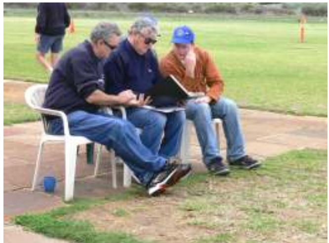
The Brains trust..

I am hoping that someone will do a potted article on the basics of standoff scale so more people will know what it takes to be competitive in this event and thus help increase numbers- HINT HINT!!! - ED