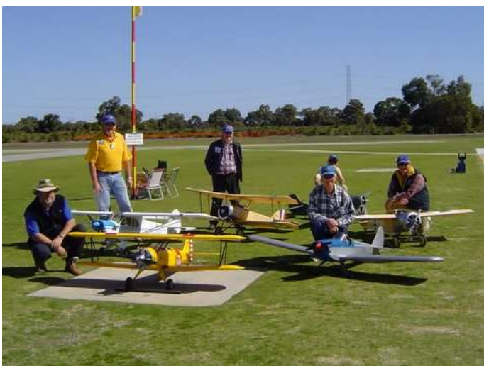
The lineup..looks like you had a beautiful day for it guys!!