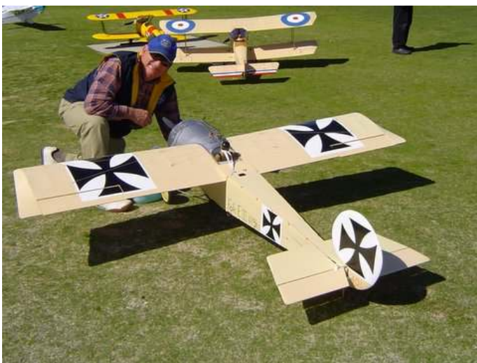
A lovely Eindecker..

Some Photo's from the large scale event held at WAMASC Last Month