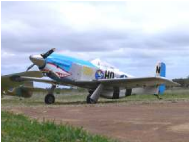
P51D ready for bomber escort..