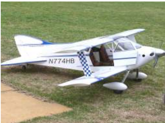
Sorell Hiperbipe. Do the doors really open that far forward?? What a great idea! Make entry/exit much easier in full size version..