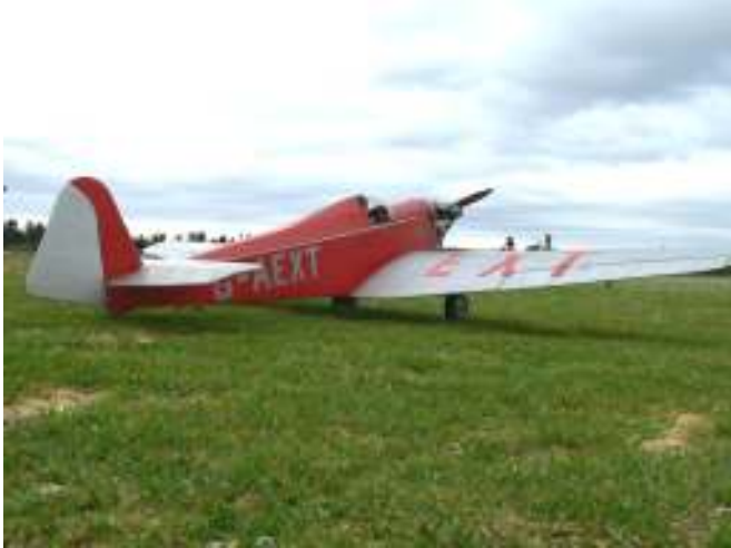
Ken's dart Kitten..

As promised, here are some pics taken at last months standoff scale event.