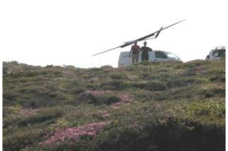
Estrala on short final..