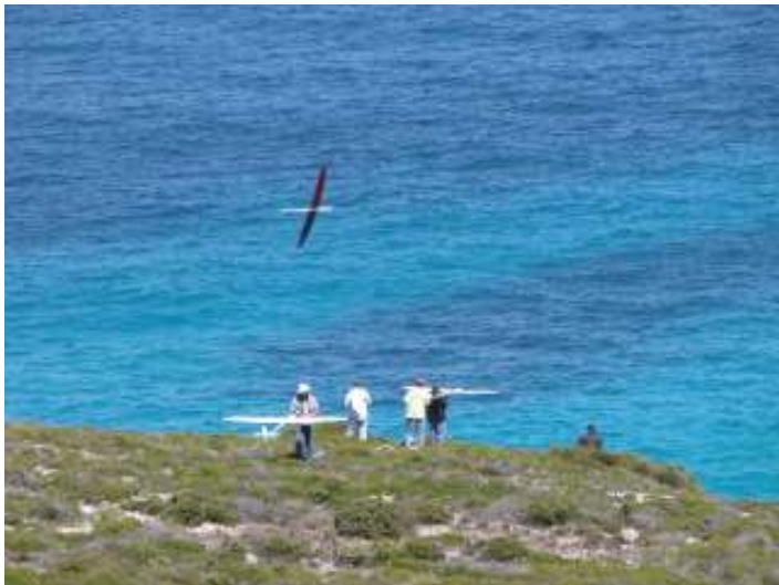
Tim Kullack's Estrala at Base A..