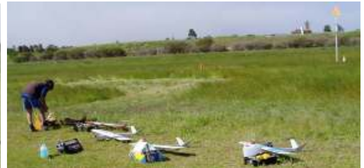
The lineup at the SE corner of the field. The Mown area is the new pylon pilot holding zone..