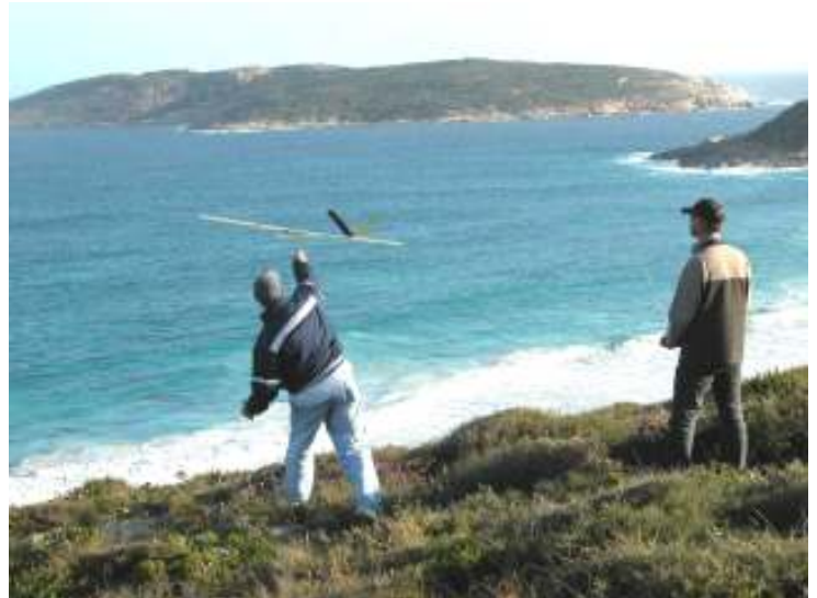
Whippett on launch..