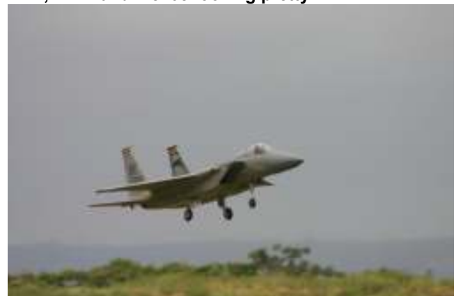
F15 on short final..