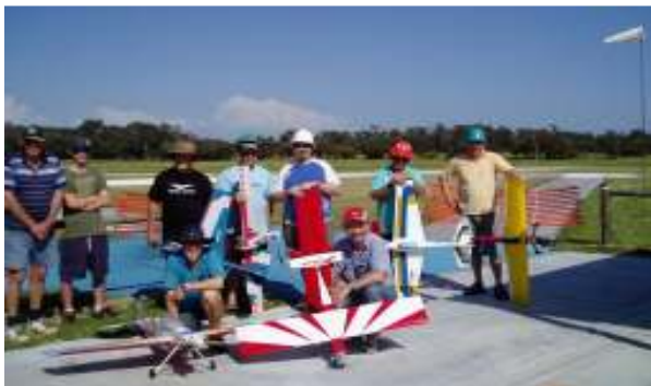
The lineup..great to see the locals get involved!