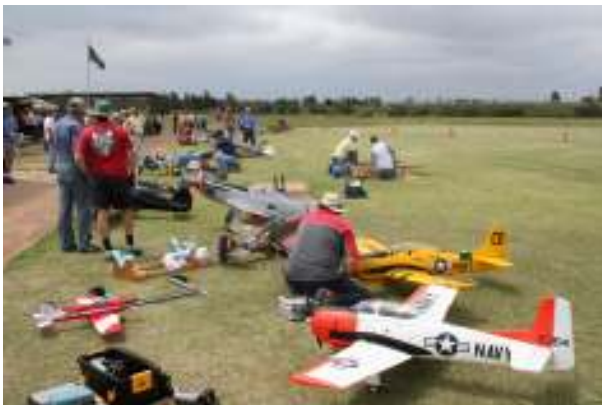
The Lineup on the Apron. Nice pair of T28's..