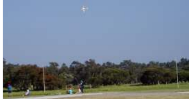
And its around the poles we go!!