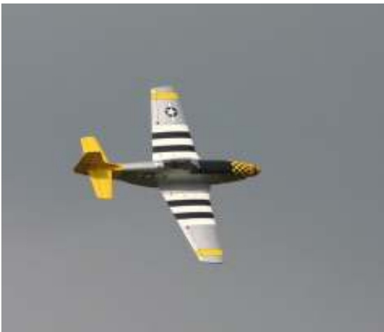
Charlie Chua's P51 excites the air show crowd..