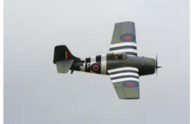
Greg McClure shows how warbird flying is done..