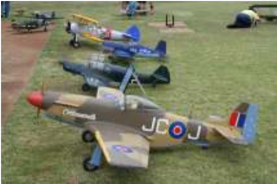
P51, Me108, Corsair and PT17 wait the call to action