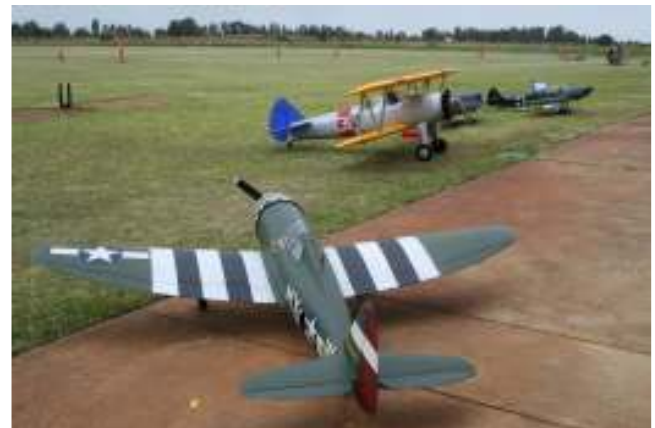
P47 , PT17 and Me108 looking pretty..