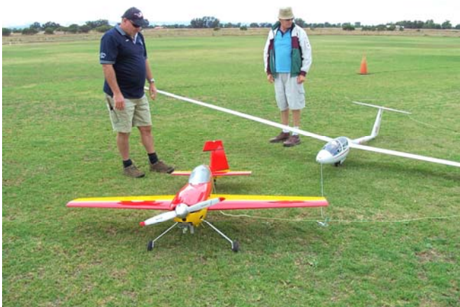
Glen and Danny contemplate the complexities of attaching a glider to a tug..

Thirteen pilots turned out for this event and brought along some awesome looking scale gliders with wing spans from 3.8 to 5m! Aircraft such as the Glass Flugul 304, Fox, ASW24, ASW27, Discuss DG600 and DG505 were present - just to name a few!