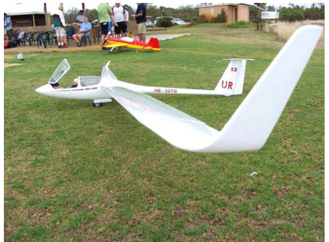
Nice pic of the ASH25 – Love those molded winglets!!

The sky was buoyant, lift was everywhere and even I, a novice, couldn't make a mistake. Sink was not a word uttered all day – it was just lift, lift lift.