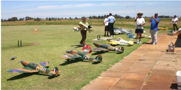
A LINE UP OF FINE SCALE MODELS AT A KAMS SCALE RALLY

The mown grass flying surface at KAMS is perfect for the operation of flying scale model aircraft and quite a few of the members are very active in this area of the sport/hobby.