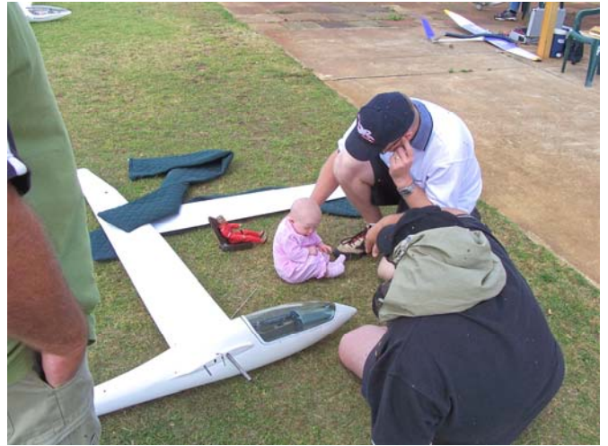
Are you sure she won't fit in there?