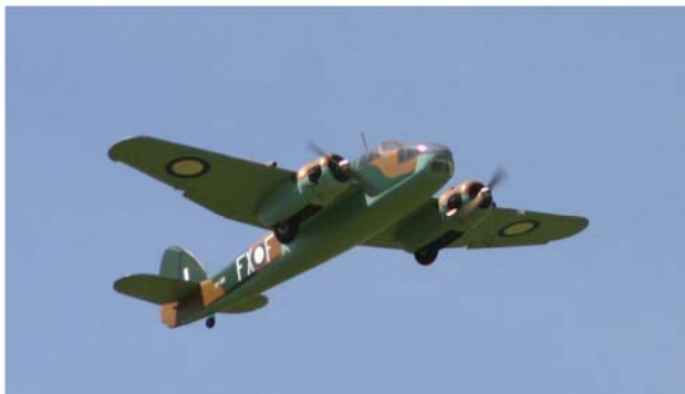
A TWIN ENGINE BRISTOL BEAUFORT DRONES OVERHEAD

The more complex models may have retracting undercarriages, working flaps, landing lights etc.