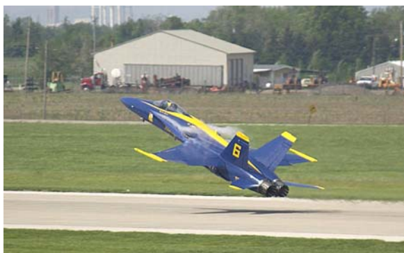
Damn! Where's that undercart lever...