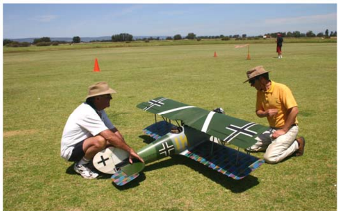
STARTING UP A FIRST WORLD WAR PFALTZ DXII PRIOR TO ANOTHER FINE FLIGHT

Large Scale is where the really big models come out, the judging is much the same as in Stand Off Scale.