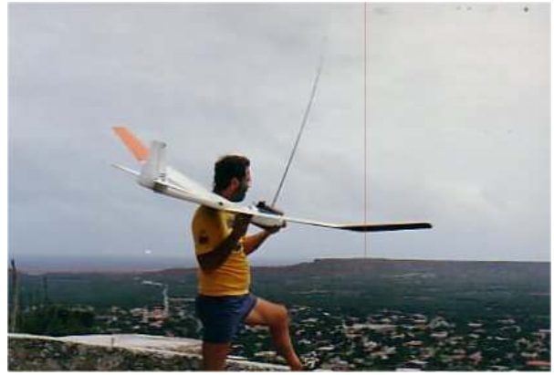
About to launch. The sea is in the distance although not very clear