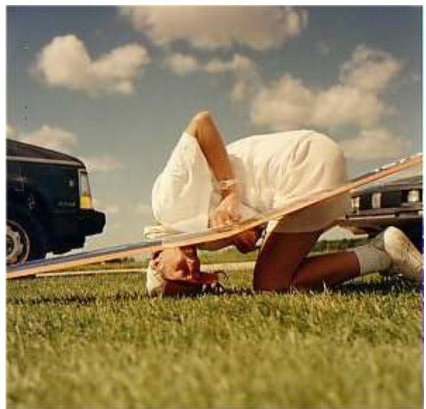
Putting tape on the underside of my wing in an unconventional manner. Great difference in clothing from our summer flying to our winter flying.