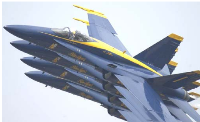
Now..where did the rest of my flight get to???

Mobile phones are not permitted in the pit areas or the pilot holding areas. Mobile phones are to be positioned in the rack located in the sheltered area adjacent to the canteen.