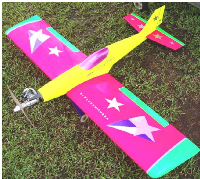
A sexy S1D racer...love those trimmings...