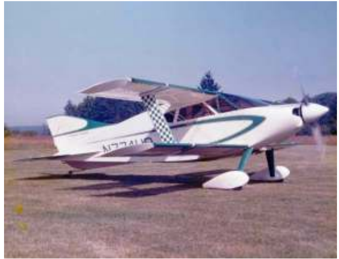
Sorrell Hiperbipe.. www.marksorrellco.com/