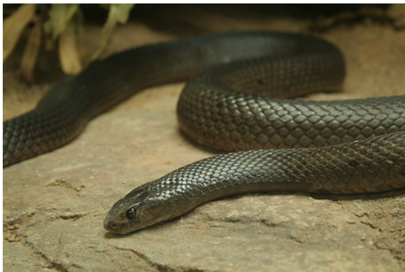
Western Dugite (greenish when juvenile)

You are reminded that one must not interfere with a snake if one is encountered and under no circumstances should you attempt to cause it harm. Simply withdraw from where it is located and alert other people at the field of its location. They are generally shy of larger animals, such as we humans and will retract to what they consider to be safer ground. New pamphlets on treating snake bite are being obtained and will be placed in the First Aid cabinet at the field. If someone is unfortunate enough to receive a snake bite the instructions in this brochure should be followed. The former instructions of cutting the wound and applying tourniquet's is now outdated.