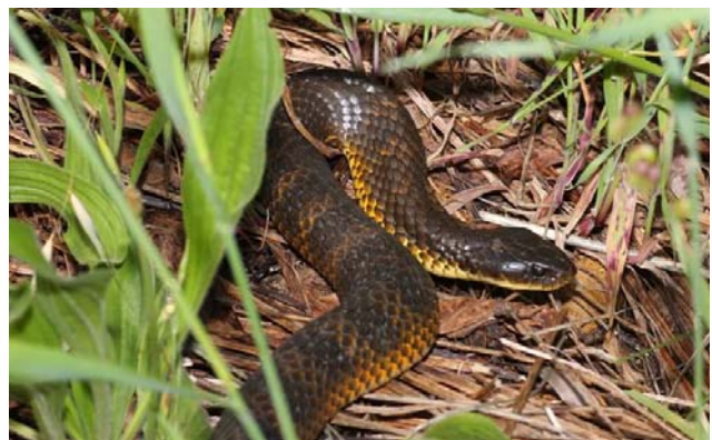
Western Tiger Snake (note banding on body)